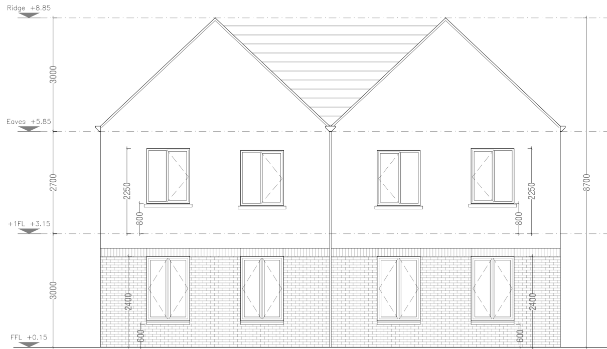
House Type L1 Semi- Detached Front Elevation