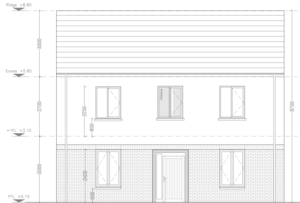
House Type L1 Semi- Detached Side (Entrance) Elevation